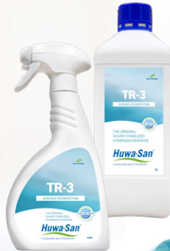
Huwa-San TR-3 Spray (500 ml)

Only need to disinfect a small area? Then use our Huwa-San TR-3 range to disinfect all kinds of surfaces. Discover our Huwa-San TR-3 Spray and our Huwa-San TR-3 refill pack.